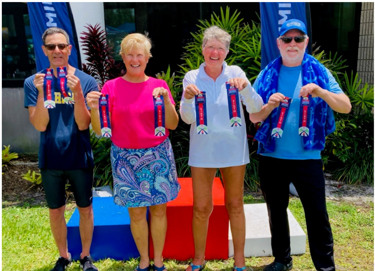
The Big 10 + 1 Gator Show Off 6th Place Finishes In The 200 Medley and 200 Free Relay